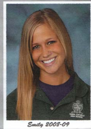
3 1/2 x 5 - Magnet