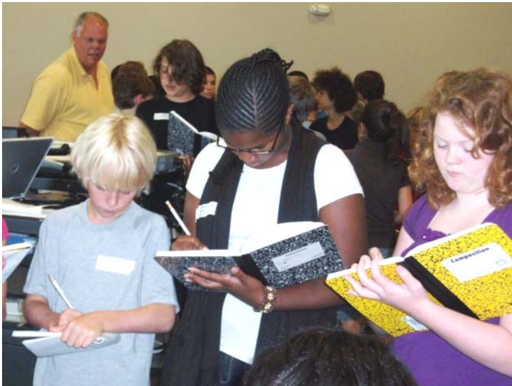
Throughout the retreat, students reflected on the impact of happiness and a positive attitude on success.