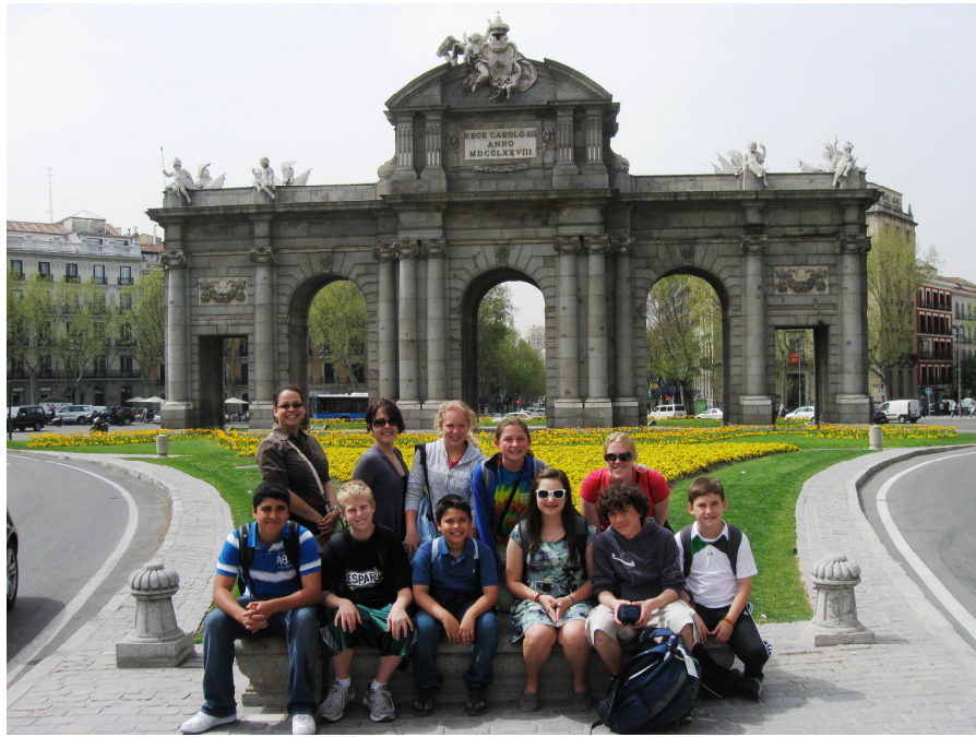
While in Spain, students and teachers visited a variety of historical sites including the Puerta de Alcalá, which stands at the Plaza de la Independencia in Madrid.

As an International Baccalaureate (IB) Middle years and Primary Years Program School, Independent Day School emphasizes the study of world languages and focuses on the development of future citizens who are internationally minded.