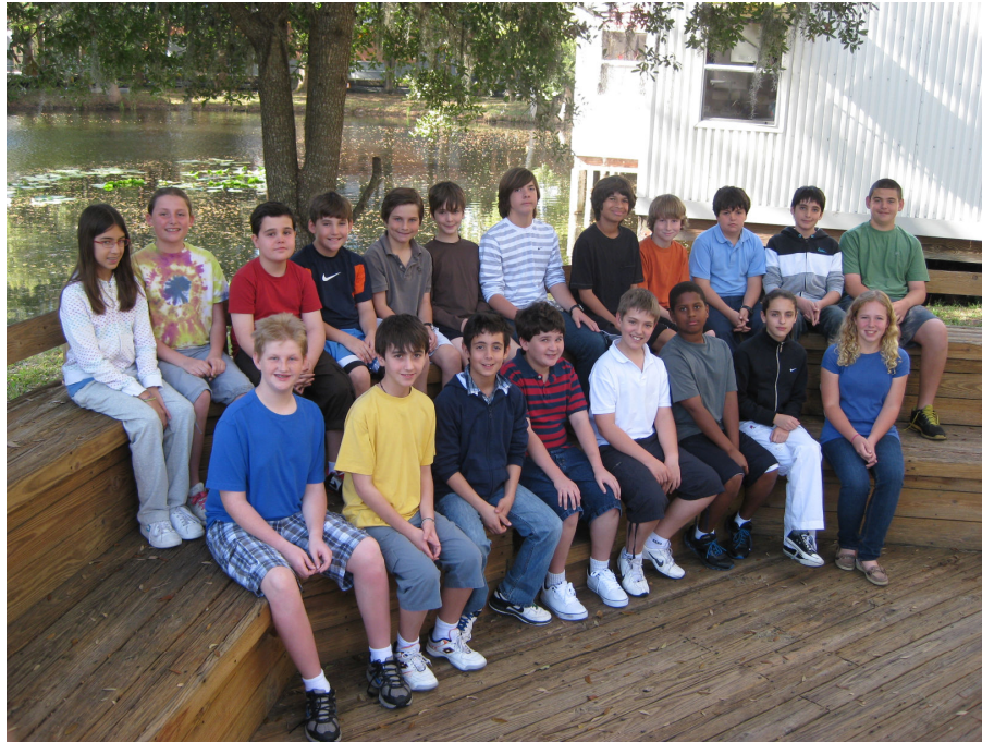
Ten students in grades fifth through eighth and two teachers from Colegios Ramón y Cajal in Madrid, Spain participated in the most recent international study program at Independent Day School-Corbett Campus. Each Spanish student was placed with a volunteer IDS host family for the three-week stay. During the day, they attended classes and after-school activities with their IDS student “buddies.”

International study program between Independent Day School-Corbett Campus and Colegios Ramón y Cajal in Madrid, Spain builds meaningful, personal connections.